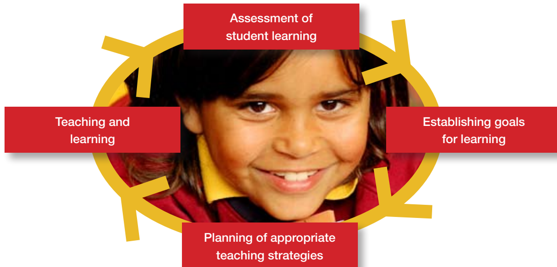
FIGURE 1: INTEGRATING PLPs INTO THE TEACHING AND LEARNING CYCLE

There are some key questions that inform the development of a Personalised Learning Plan. These questions correspond to stages of the teaching and learning cycle depicted in Figure 1.